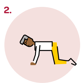
Use your arms to push yourself onto your hands and knees.