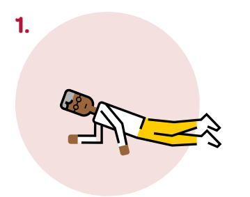
Roll onto your side, and then push up onto your elbows.

If you know you can't get up, or feel pain in your hip or back, then try to call for help by using your phone or pendant or by banging on radiators or walls.